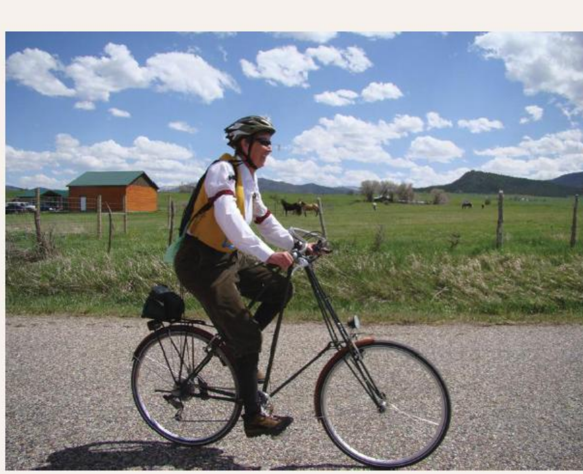
It's not a costume. It's an athletic uniform. Costumes are for theater. When a bear chases you down a mountain road, he is not looking for a popcorn refill.